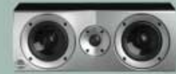
POINT5 MKII C.5 Center Channel